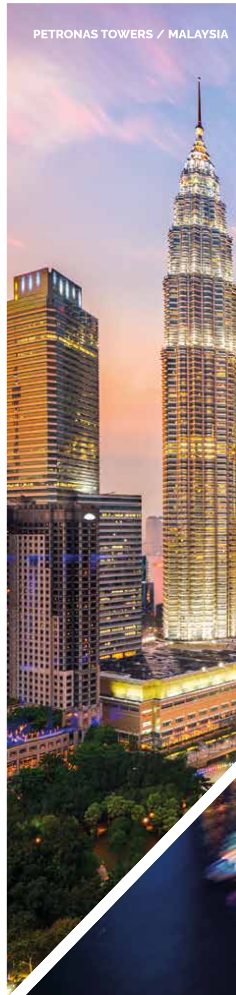
PETRONAS TOWERS / MALAYSIA