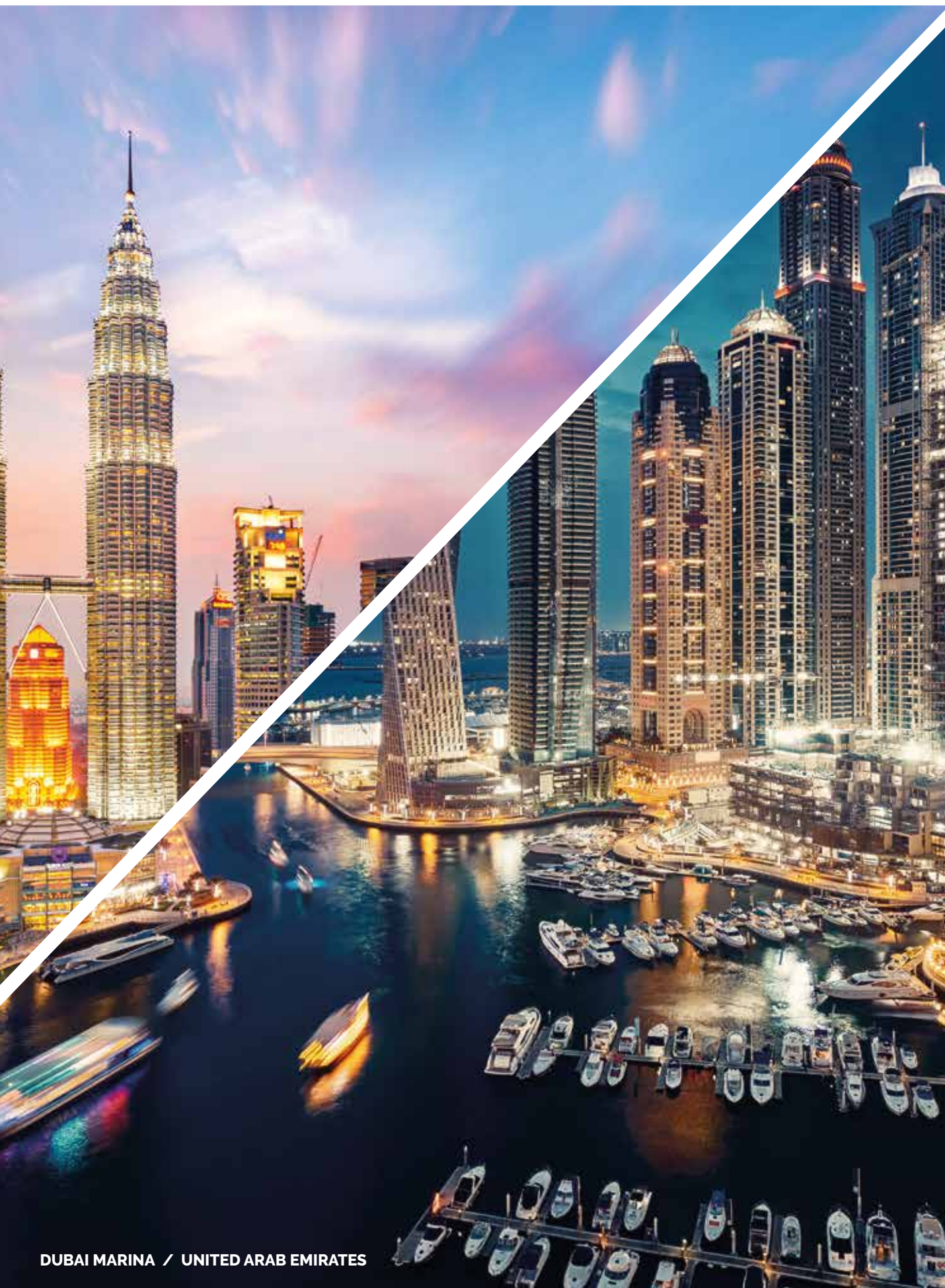
DUBAI MARINA / UNITED ARAB EMIRATES